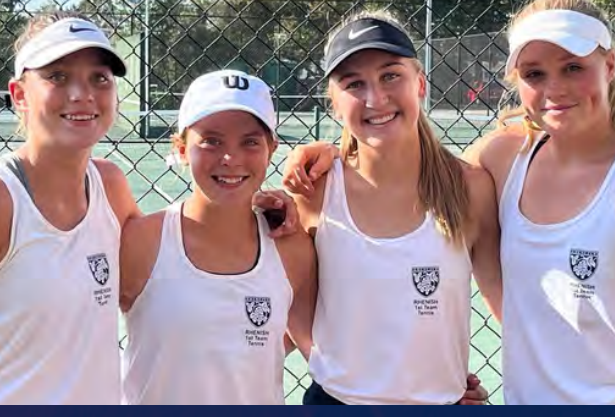
VICTORIOUS U19A AFTER THEIR VICTORY OVER BLOEMHOF